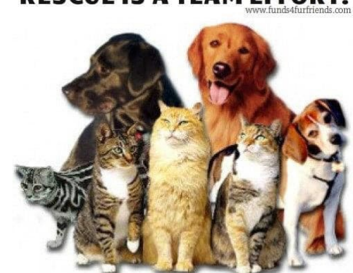
It's NOT about ...who has more money or more followers and who did what. IT'S ABOUT SAVING LIVES!